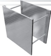
ShoreLite Shield 2.5

Note: ShoreLite modular system must be assembled before use.